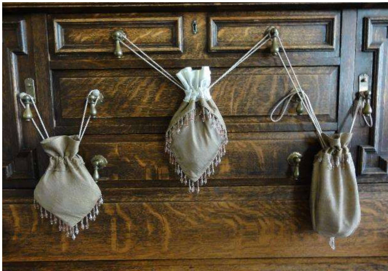
CUSHION COVER RETICULES #1 AND #2, PLUS BONUS RETICULE DUE TO OFF-CENTRE BACK ZIPPER (LIKE #5).